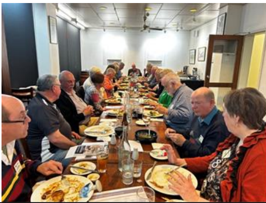
Members enjoying good food and fellowship around the Long Table at The Grosvenor Hotel.