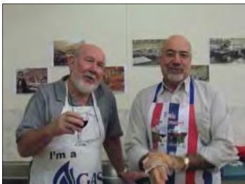
"I would say, without a doubt, that we have this cooking caper well under control."