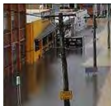
Encounter Bay Rotary Club sent financial support to disaster areas.