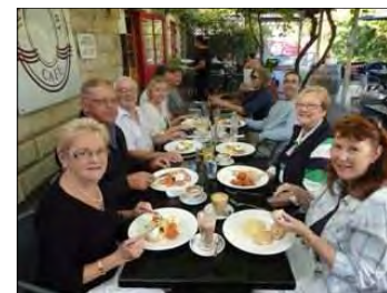
Enjoying fellowship at the weekend in Robe, (above) & (below) the Club's Christmas BBQ held at Kent Reserve.

“What a good Year Club Service has had this year!”