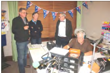
In the studio of Community Radio Station 90.1 Happy FM