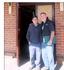
Rotary Youth Driver Awareness Day, Victor Harbor.