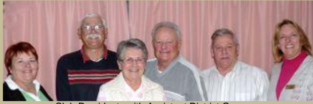
Club Presidents with Assistant District Governor